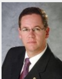
Hon. Richard Dalla-Riva, MLC Scrutiny of Government Shadow Minister for Manufacturing & Exports