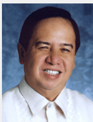
Hon. Richard J. Gordon Senator Republic of the Philippines